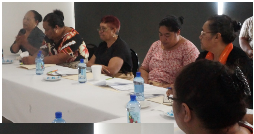
Below: Participants from Higher Education Institutions during the consultation on the regional convention.